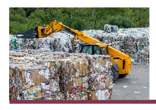
Waste and Resource Recovery