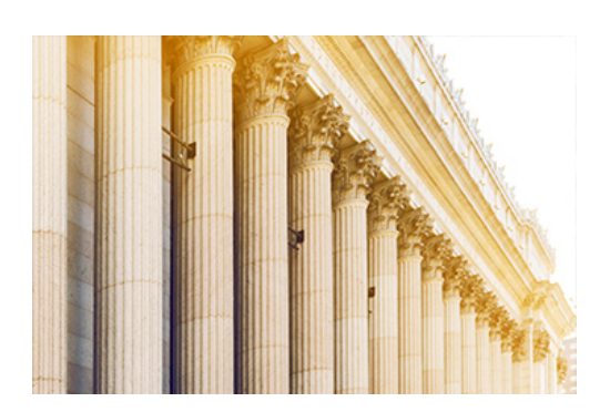
Home Care Assurance Reviews Coming your Way!