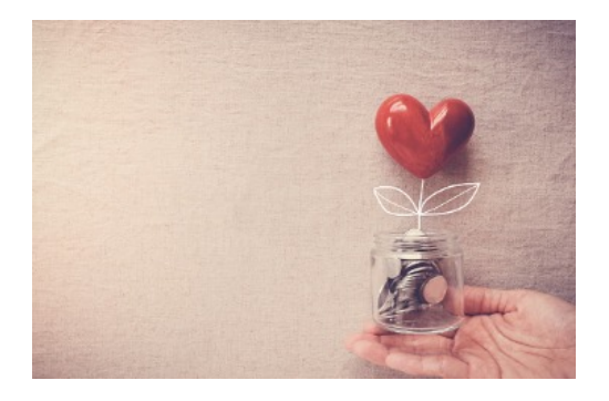
Proposed Changes to Financial Reporting