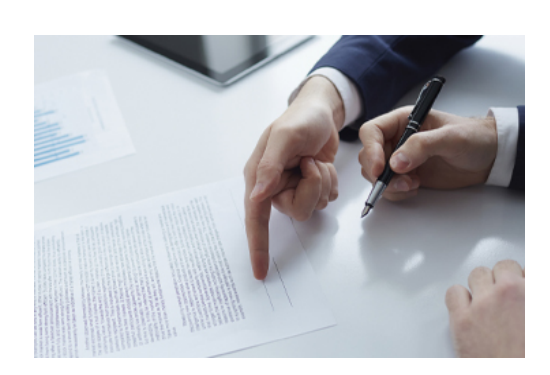
Pandemic leave and changes to annual leave in Modern Awards