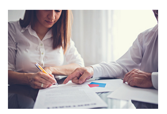
JobKeeper amendments to the Fair Work Act