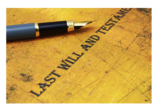
Thinking about getting your affairs sorted?