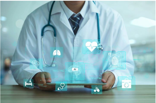
Navigating Al's Role in Healthcare: Legal Implications