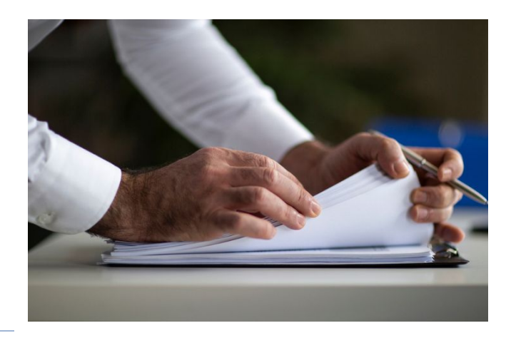
Unfair Contract Terms regime crosses over into Fair Work jurisdiction