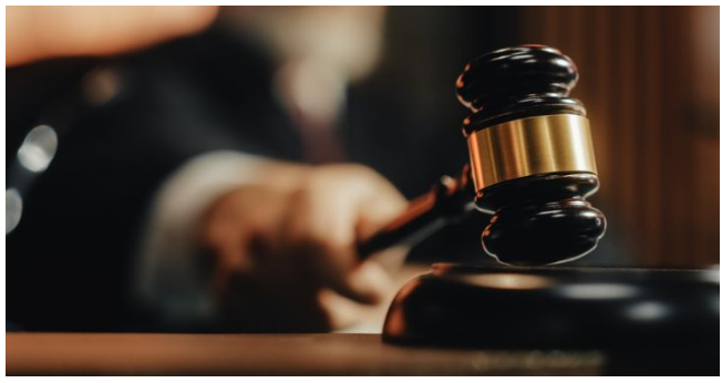
Further enforcement action - Failure to obtain Director Identification Numbers