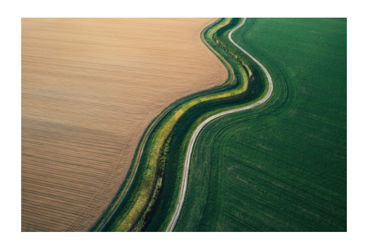
How green is your project? – Environmentally Sustainable Procurement Policy set to commence i...