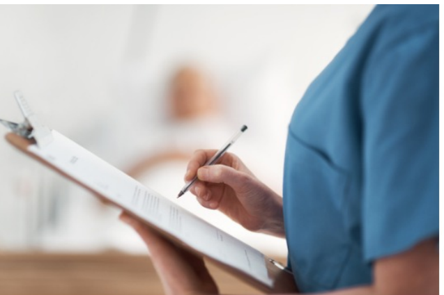
Only one month to go – Have you completed your annual Key Personnel Suitability Matters check?