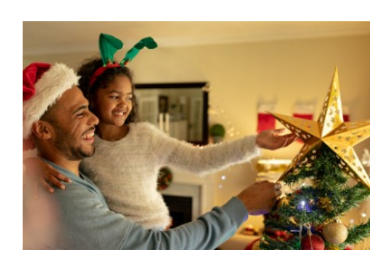
'Tis the season to be jolly! (And navigate Christmas between two households!)