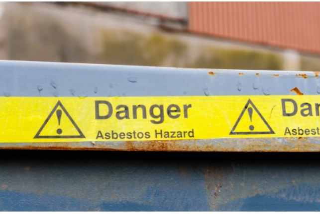
Developer fined for moving and burying soil containing asbestos in contravention of a planning...