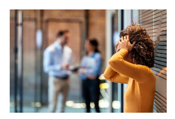
Enforcement powers in relation to positive duty on organisations to eliminate workplace sexual...