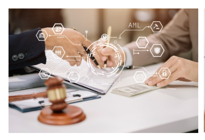
Anti-corruption on a national scale