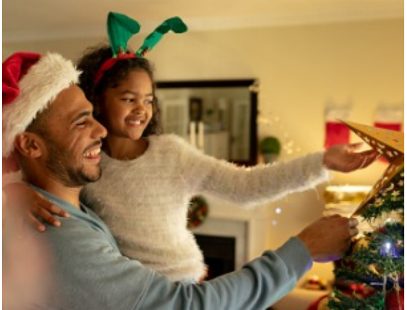
'Tis the season to be jolly! (And navigate Christmas between two households!)