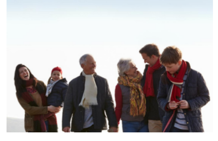
Your Will - The Effect of Marriage, Divorce and Separation