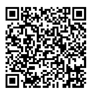
Scan this QR Code to give instant feedback on the presentation